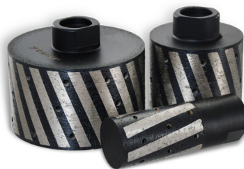
Boreway Machinery Co., Ltd. www.diamondtools.top www.boreway.com