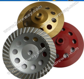
Boreway Machinery Co., Ltd. www.diamondtools.top www.boreway.com