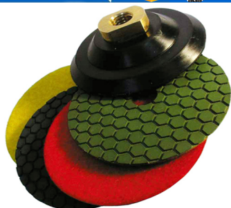
Boreway Machinery Co., Ltd. www.diamondtools.top www.boreway.com