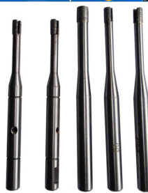
High strength diamond PC drill bit

Boreway Machinery Co., Ltd. www.diamondtools.top www.boreway.com