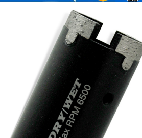
Diamond construction drill bit

Boreway Machinery Co., Ltd. www.diamondtools.top www.boreway.com