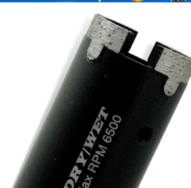
Diamond construction drill bit

Boreway Machinery Co., Ltd. www.diamondtools.top www.boreway.com