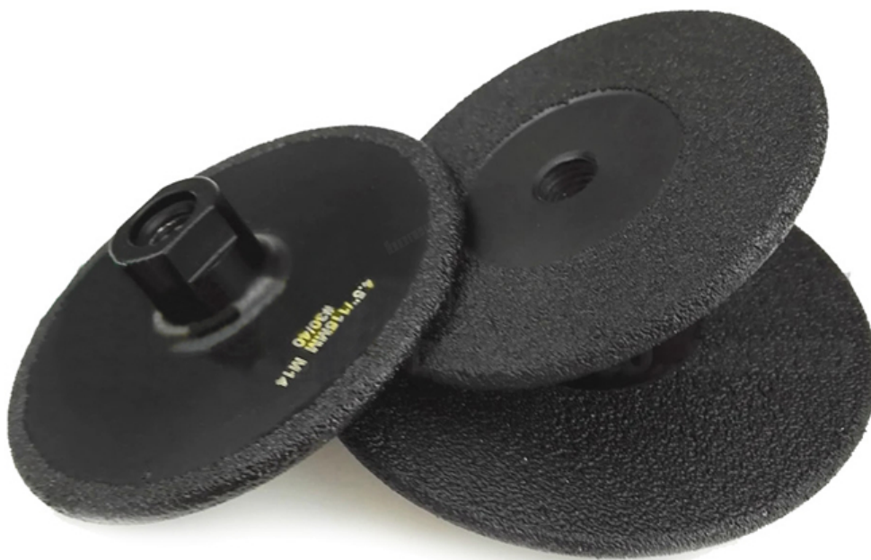
Vacuum Brazed Diamond Grinding Wheel

Boreway Machinery Co., Ltd. www.diamondtools.top www.boreway.com