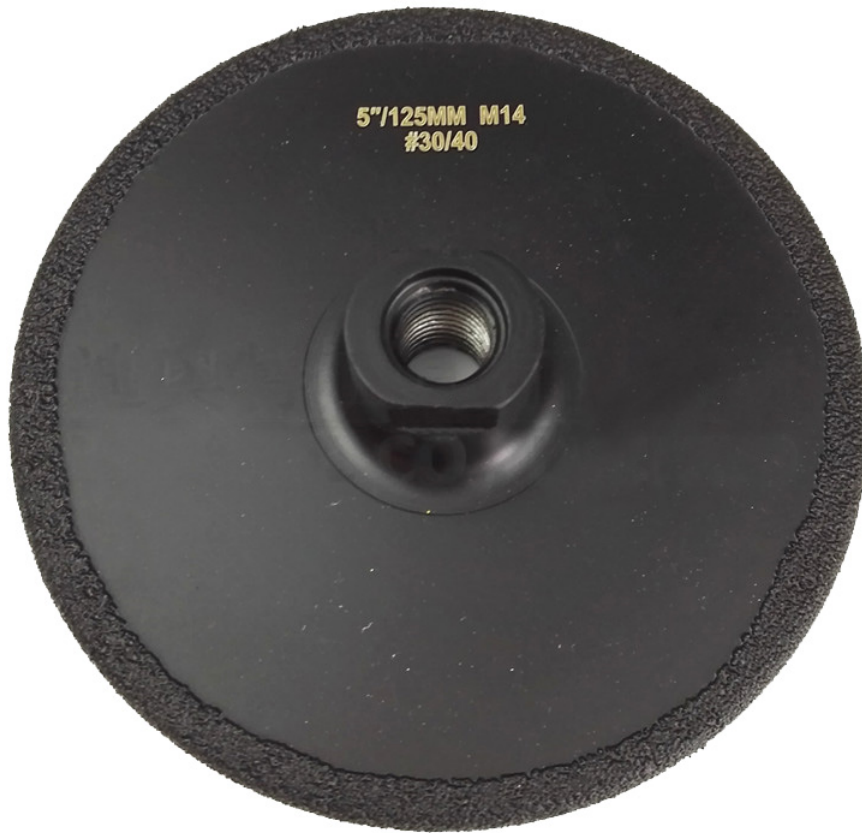
M14 Thread Vacuum Brazed Diamond Grinding & Cutting Wheel