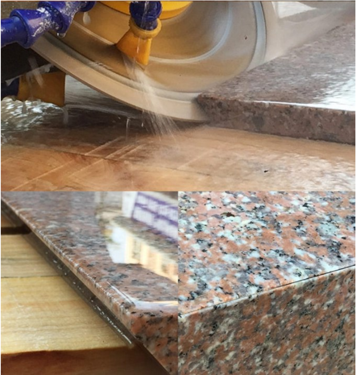
China Diamond Segments For Cutting Marble Manufacturer ,Stone Blade Segment Cutting Effect: