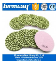
Resin Bond Concrete Floor polishing pads