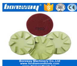
Flower Floor Polishing Pads