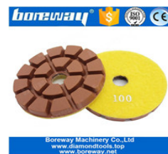
Resin Floor Polishing Pads