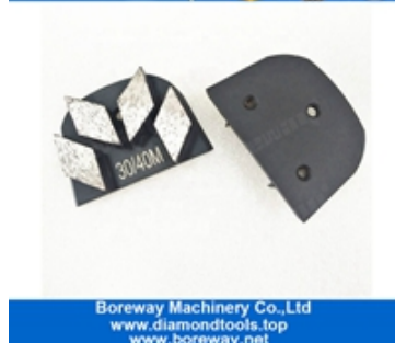
Four Segment Grinding Shoes