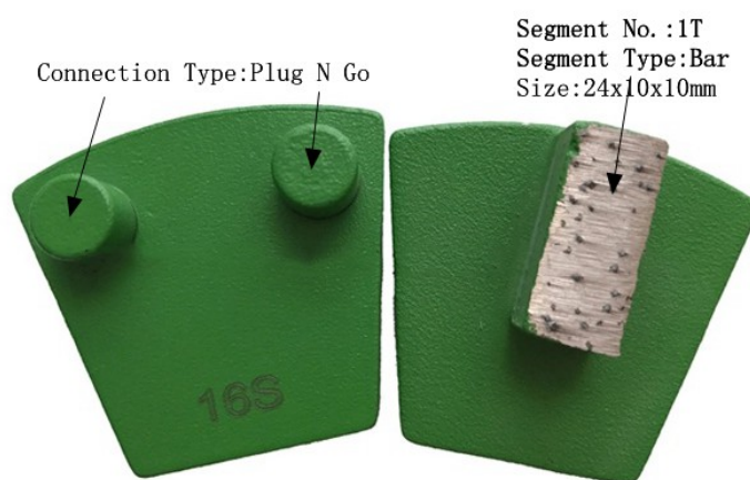
Werkmaster Diamond Concrete Grinder With Single Bar Segment Size 24x10x10mm 16 Grit Soft Bond

Werkmaster Diamond Concrete Grinder With Single Bar Segment Size 24x10x10mm 16 Grit Soft Bond: