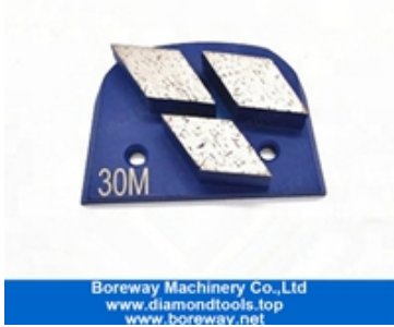
Three segment grinding shoes