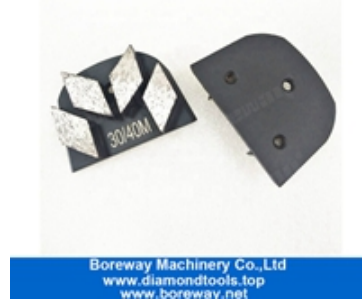
Four Segment Grinding Shoes