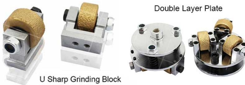
U Sharp Grinding Block