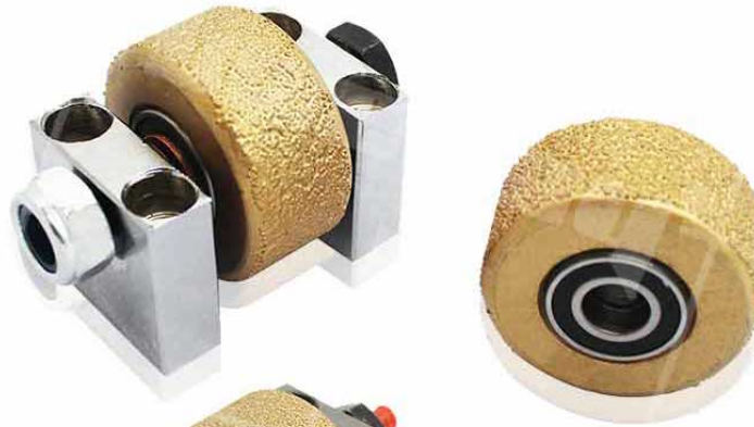
Frankfurt Bush Hammer Roller

Type: Abrasive Block Name: Vacuum Brazed Bush Hammer