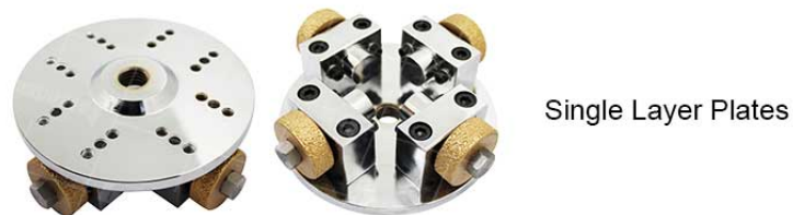
Single Layer Plates