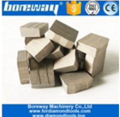
Granite Block Cutting Segment