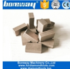
Marble Block Cutting Segment