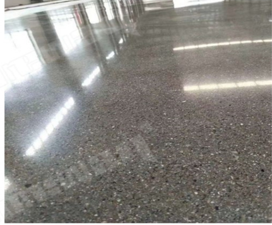
After Grinding and Polishing