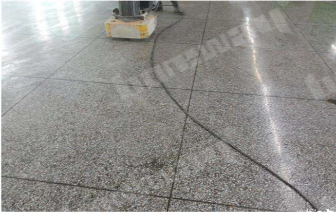
Before Grinding and Polishing