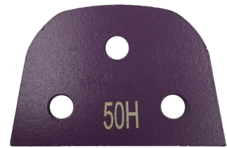
Lavina Blank with 3 Bare Holes