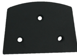
Lavina Blank with 3 M6/M8 Threads