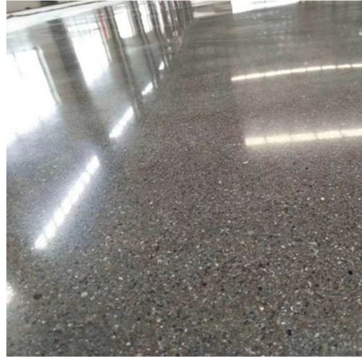
After Grinding and Polishing