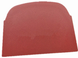
Lavina Quick Lock Blank