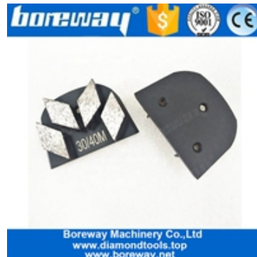
Four section grinding shoes