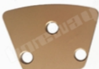
3 X Bare Holes