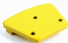
3 X M6/M8 Thread Holes