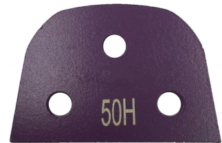
Lavina Blank with 3 Bare Holes