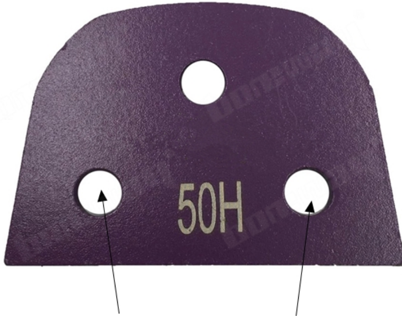
Lavina Blank with 3 Bore Holes

If you are interested in our products, you can click on me.