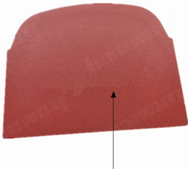
Lavina Quick Lock Blank