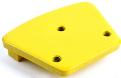
3 X M6/M8 Thread Holes