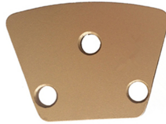
3 X Bare Holes