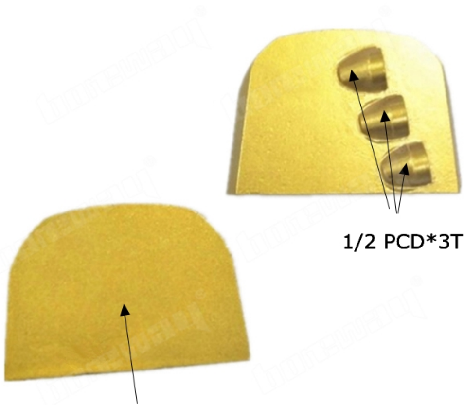
Lavina Quick Conncting Grinding Machine