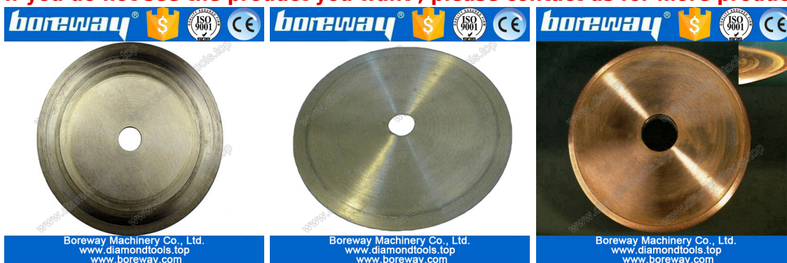
Electroplate jade cutting blade

If you do not see the product you want , please contact us for more product images .