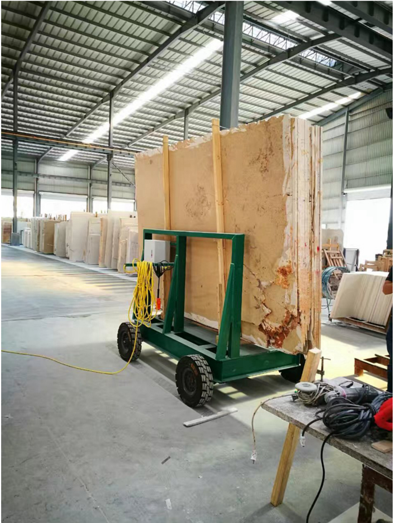
Packing & delivery