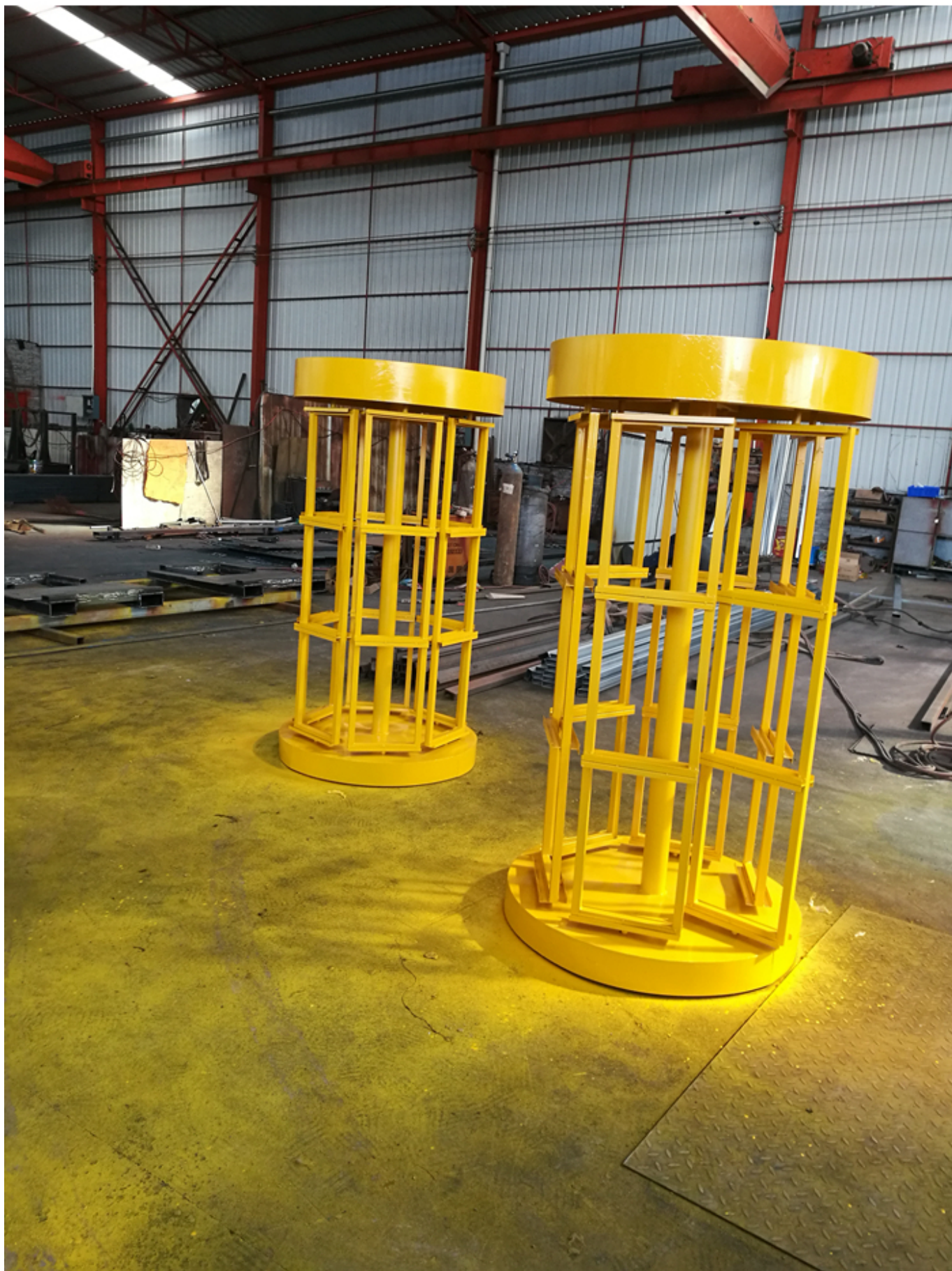
Packing & delivery