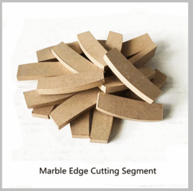
Marble Edge Cutting Segment