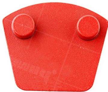
Werkmaster Two Pins Fan Shape Blank