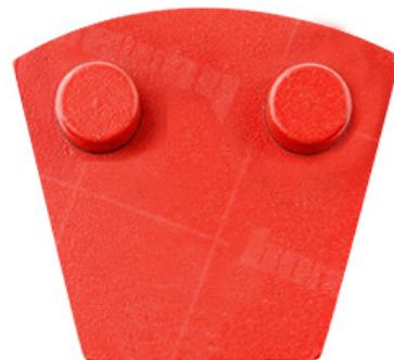
Werkmaster Two Pins Trapeziod Shape Blank