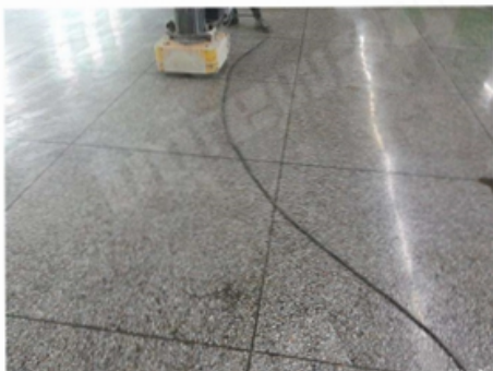
Before Grinding and Polishing