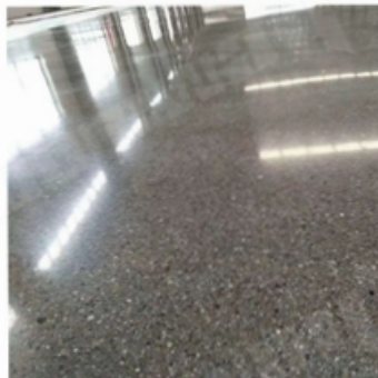
After Grinding and Polishing