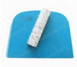
Boreway Machinery Co.,Ltd www.diamondtools.top www.boreway.net