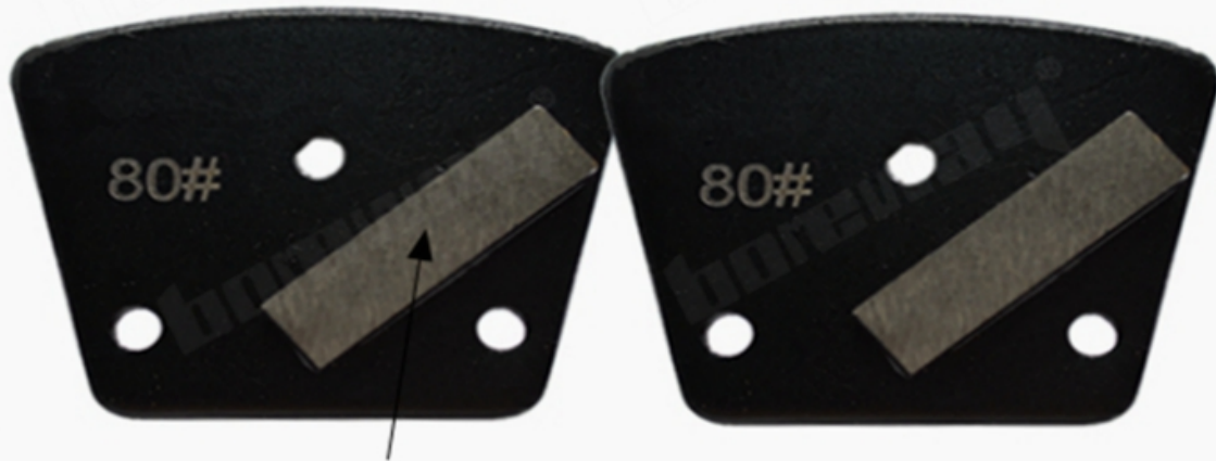
Size: 40*10*10mm*1T Single Bar Segment