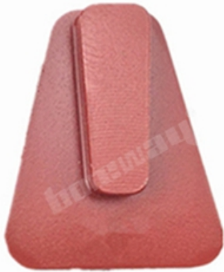
Husqvarna Redi Lock Blank