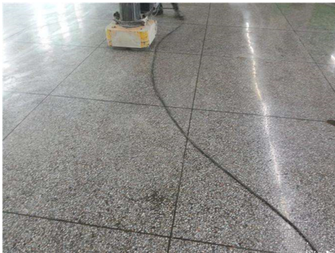
Before Grinding and Polishing