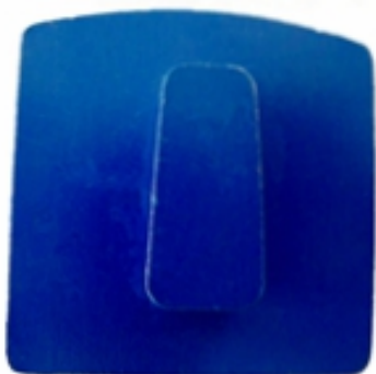
Husqvarna Redi Lock Blank

Ready Lock Metal Bond Diamond Grinding Pad Application of all types of concrete and terrazzo floors before polishing, preparation for fine grinding on floors or renovation of old floors. Suitable for general (concrete, stone) grinding use, while mostly they are used for paint, glue, epoxy removal and floor coating, high quality and high efficiency, long lifespan.