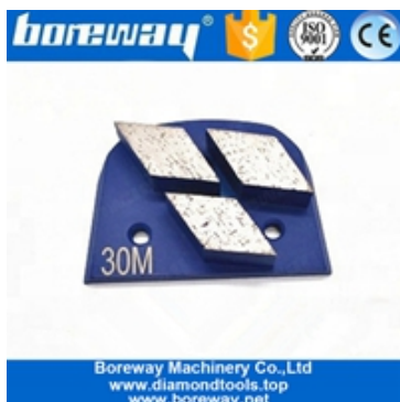
Three segment grinding shoes