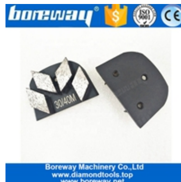
Four Segment Grinding Shoes