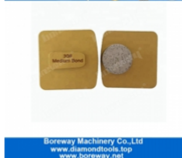
Single Round Diamond Grinding Pad