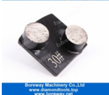
Double Round Diamond Grinding Pad