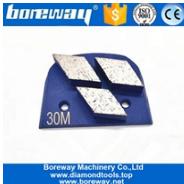
Three sectors of shoe grinding