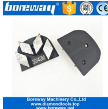
Four sectors of grinding shoes