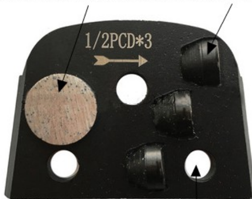
Hole: Three Bare Holes

If you are interested in our products, you can click on me.