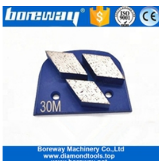
Three segment grinding shoes