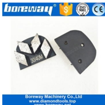
Four Segments Grinding Shoes