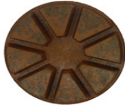
Diamond Floor Polishing Pads With Metal