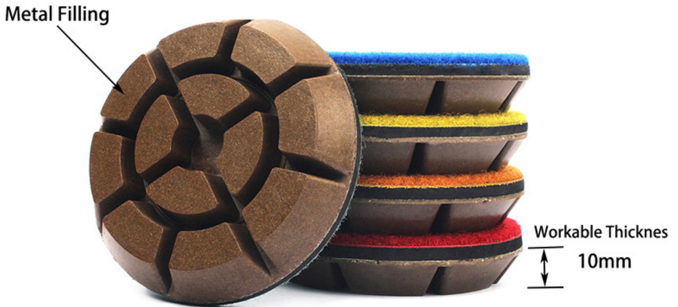
Metal Filling Diamond Resin Bond Polishing Pads For Concrete Floor