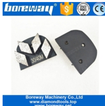
Four Segments Grinding Shoes