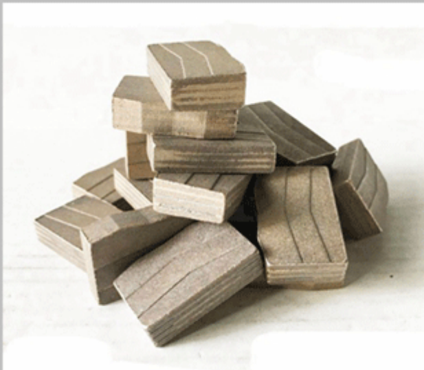
Granite Block Cutting Segment