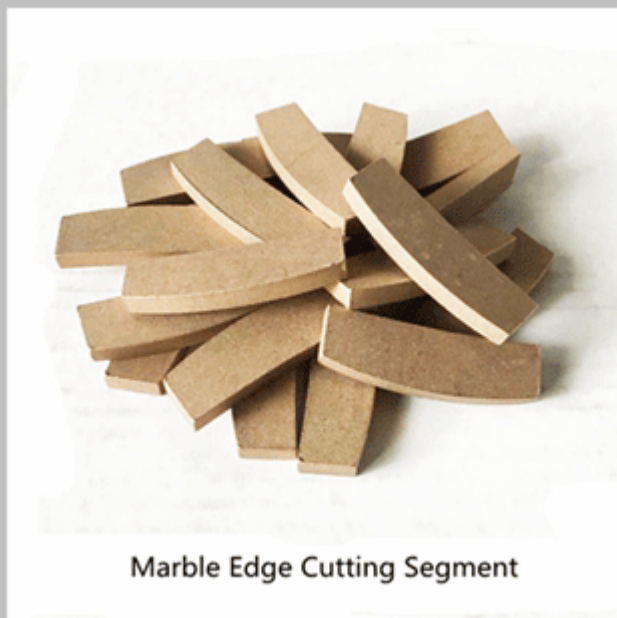
Marble Edge Cutting Segment