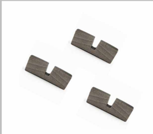
Granite Edge Cutting Segment