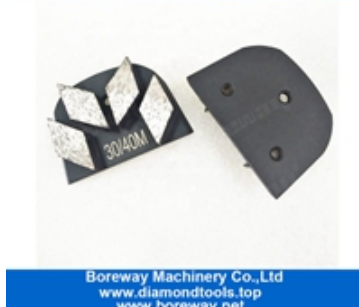
Four Segment Grinding Shoes