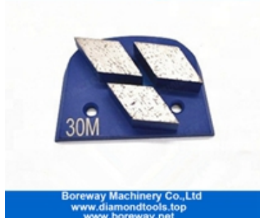
Three segment grinding shoes