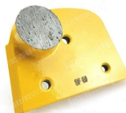
Boreway Machinery Co.,Ltd www.diamondtools.top www.boreway.net

Lavina Diamond Grinding Block Single Segment Lavina Diamond Grinding Block