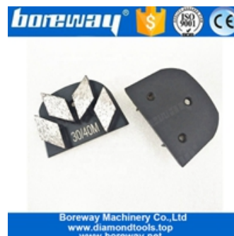
Four Segments Grinding Shoes