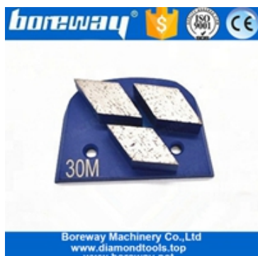
Three segment grinding shoes