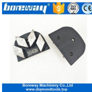
Four Segment Grinding Shoes