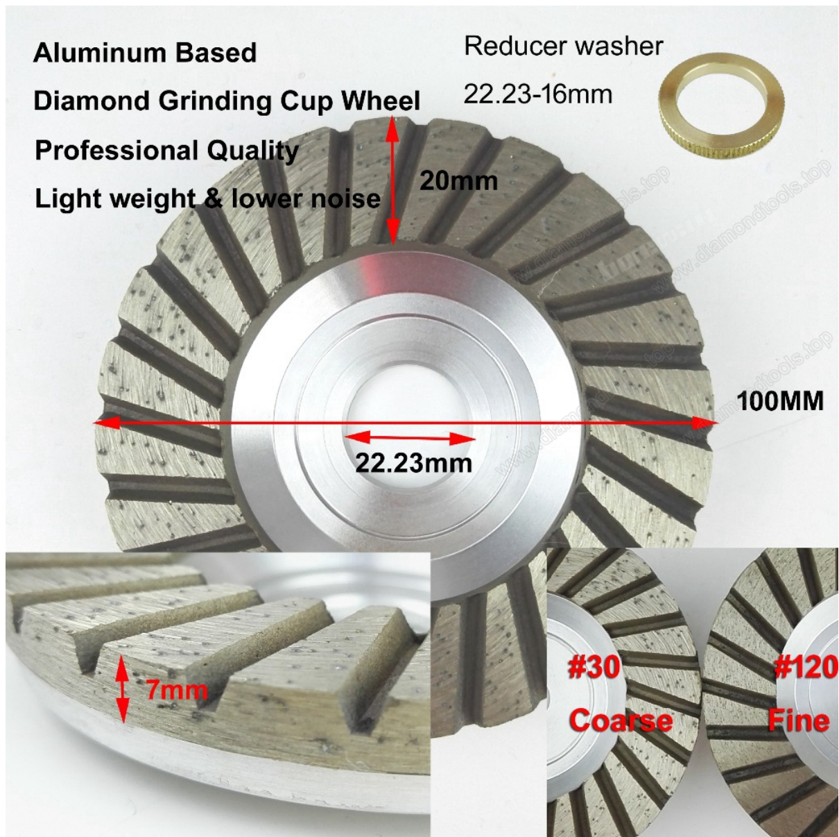
30# High quality flat turbo Aluminium base diamond grinding cup wheel for stone