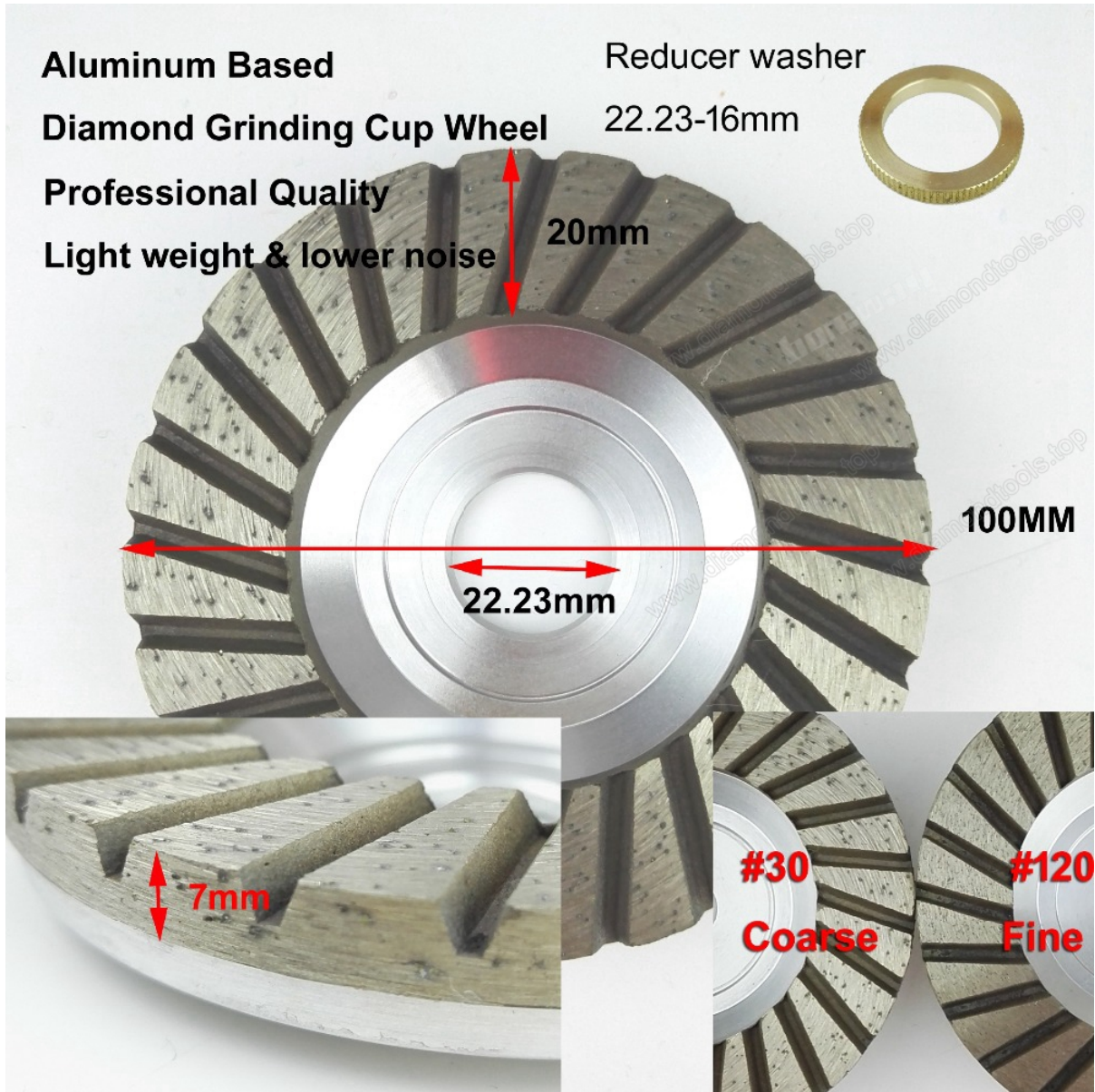
30# High quality flat turbo Aluminium base diamond grinding cup wheel for stone