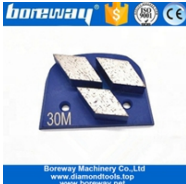
Three Segments Grinding Shoes