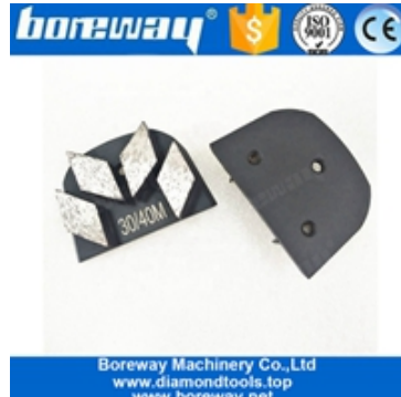
Four Segments Grinding Shoes