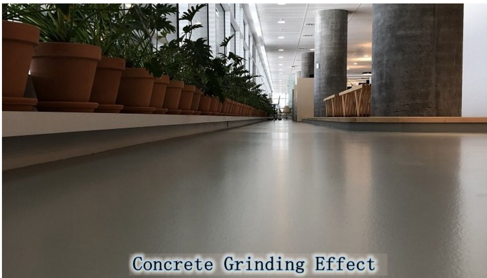
Concrete Grinding Effect