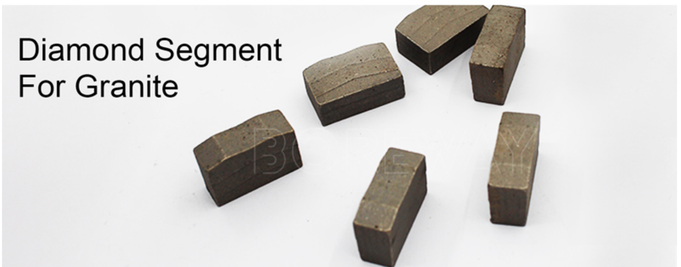
Diamond Segment For Granite