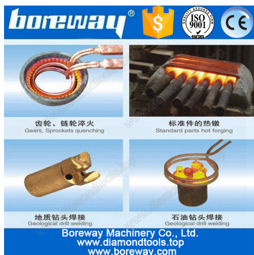
A variety of materials welding

Annex:Foot switch/hand-press switch,heating coil(can be customized),water pipes,water pumps(need to buy).