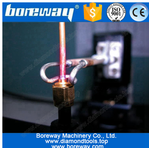
Copper tube welding