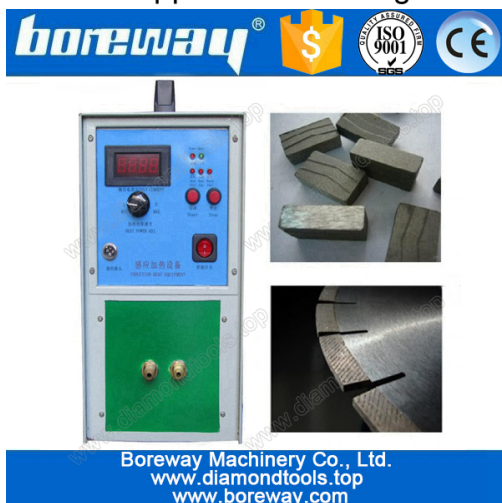
Diamond saw blade welding