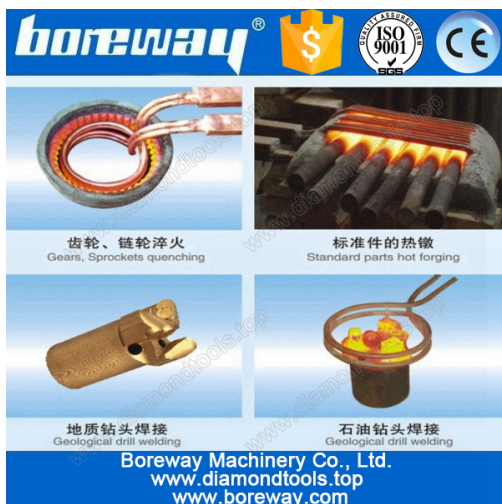
A variety of materials welding

Annex:Foot switch/hand-press switch,heating coil(can be customized),water pipes,water pumps(need to buy).