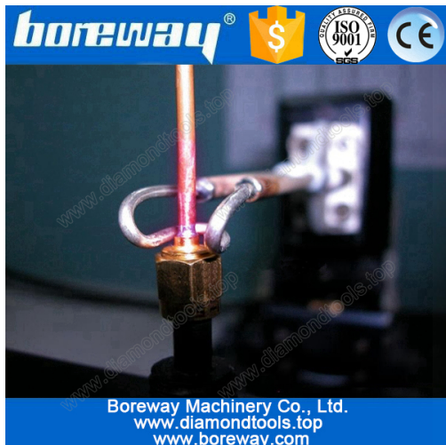
Copper tube welding