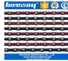
Diamond Saw Hire