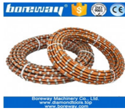
Portable Abrasive Diamond Wire Saw