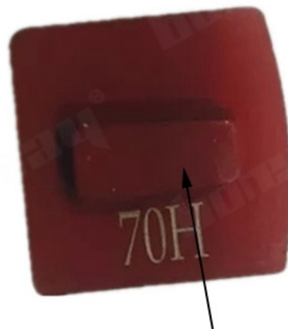
Husqvarna or Scanmaskin Redi Lock