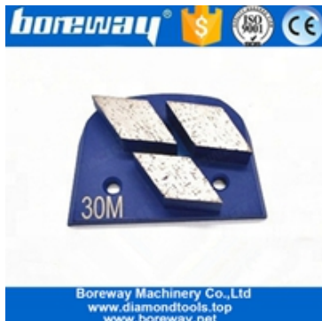
Three Segments Grinding Shoes