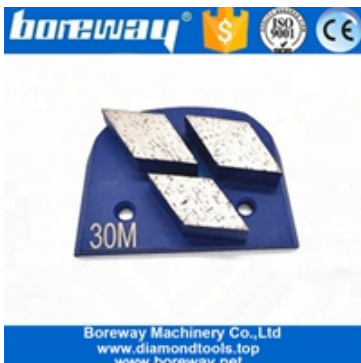
Three segment grinding shoes